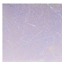
Thick film protection ChromiumVI-free