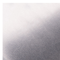
Stainless steel V2A