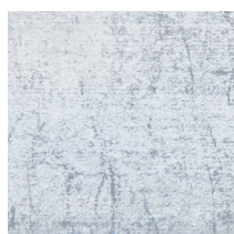
Blue galvanised Galvanic