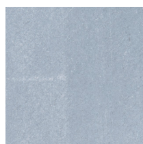
Sendzimir galvanised Immersion bath